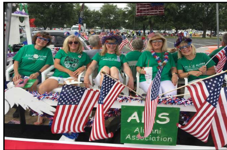
This is the way the ladies ride—so early in the morning!