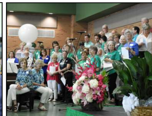
Alumni Choir prepares to close the program in memory of Miss Ellis.